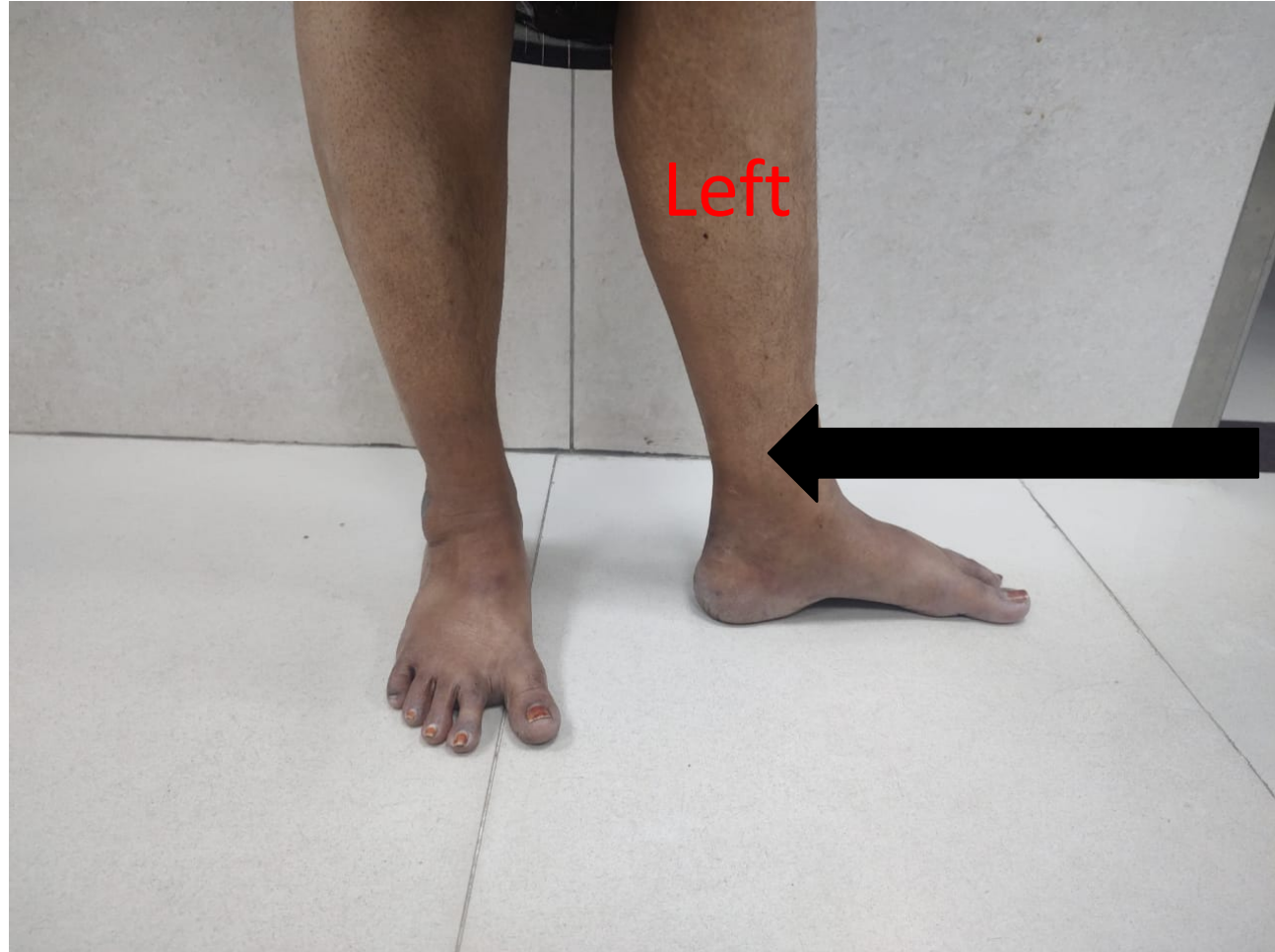
NOTICEABLE DEFECT DUE TO TENDON TEAR