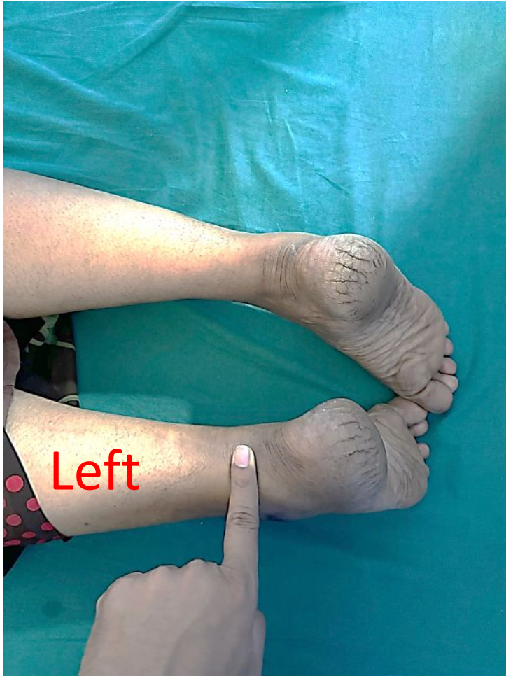
PALPABLE DEFECT DUE TO TENDON TEAR