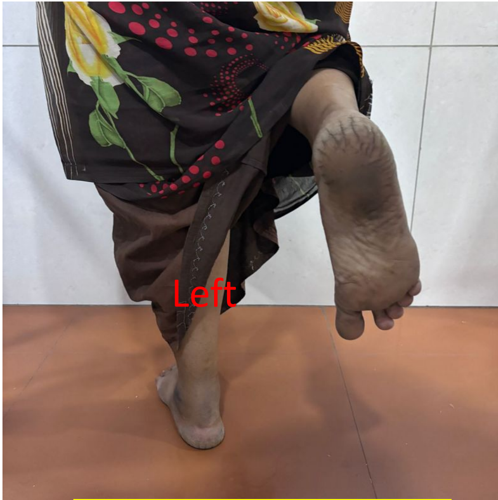
TIP TOE STANDING NOT POSSIBLE ON LEFT SIDE