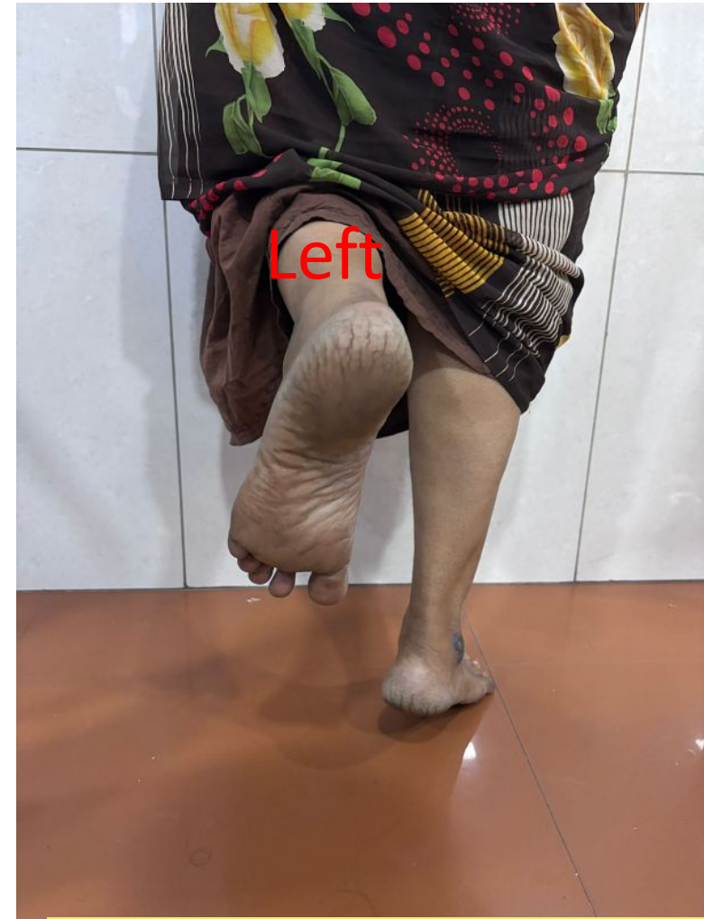
TIP TOE STANDING POSSIBLE ON RIGHT SIDE